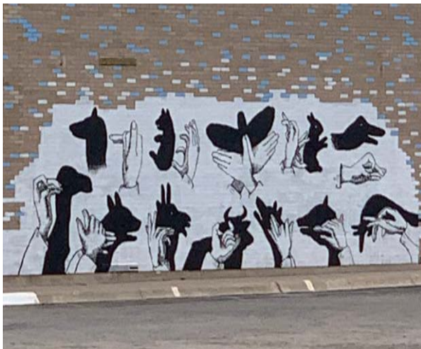
SHADOW ANIMALS WALL MURAL