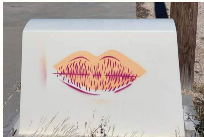
HOT LIPS MURAL