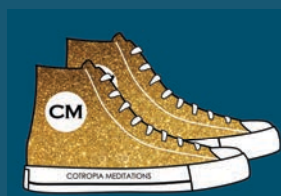
SETTLING CASES TWO SNEAKERS AT A TIME