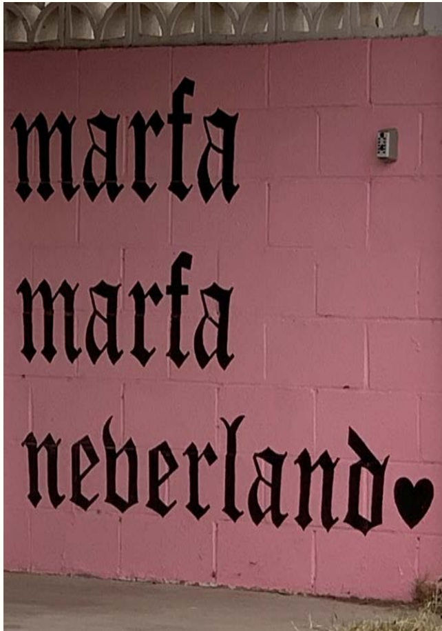
MARFA MARFA NEVERLAND WALL MURAL

I love the way Marfans (citizens of Marfa and yes that is what they call themselves) express their artistic side. Here are some examples: