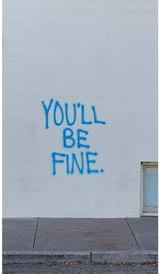
YOU'LL BE FINE WALL MURAL