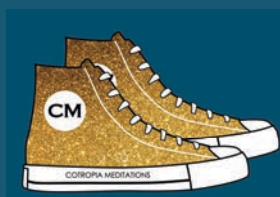
SETTLING CASES TWO SNEAKERS AT A TIME