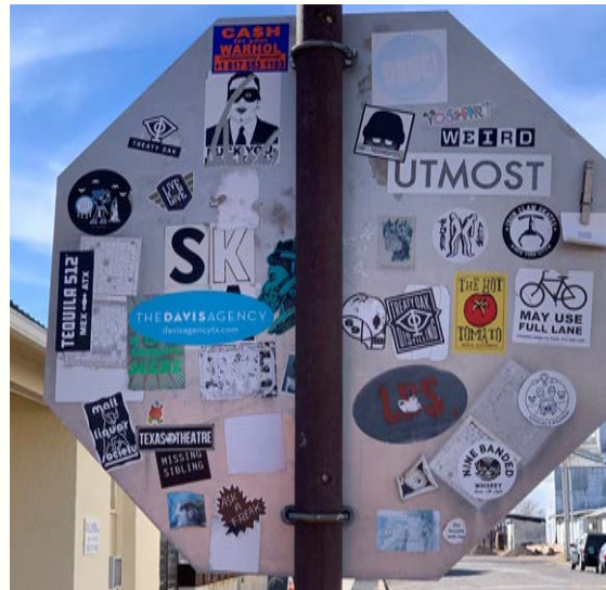
STOP SIGNS ARE FOR STICKERS