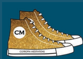
SETTLING CASES TWO SNEAKERS AT A TIME