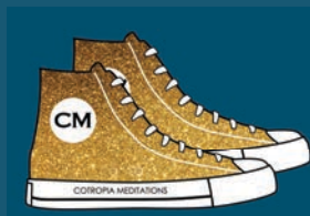
SETTLING CASES TWO SNEAKERS AT A TIME