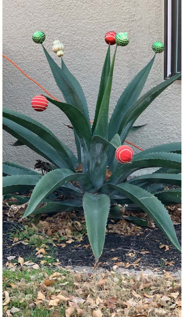
AGAVE CHRISTMAS DECORATIONS