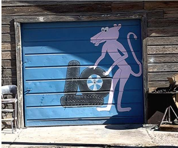
A PINK PANTHER ON THE GARAGE DOOR