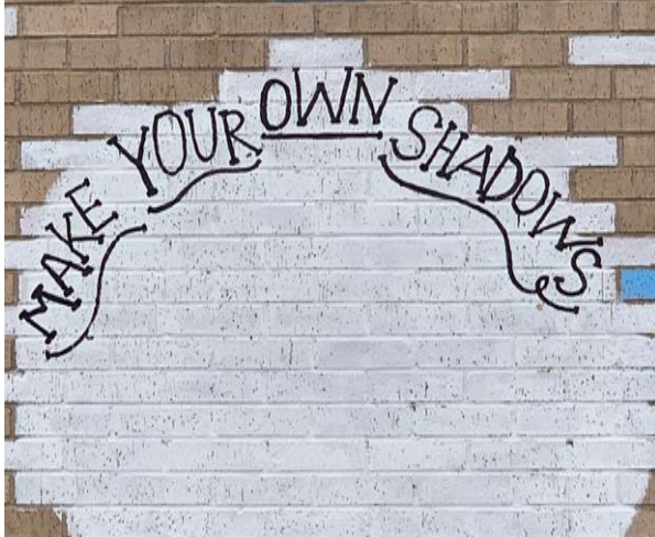
MAKE YOUR OWN SHADOWS WALL MURAL