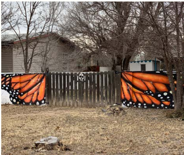
BUTTERFLY FENCE MURAL