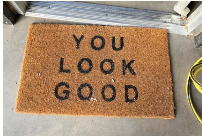
YOU LOOK GOOD RUG