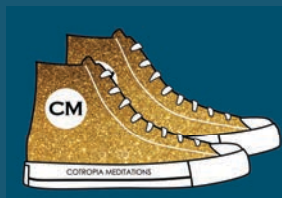
SETTLING CASES TWO SNEAKERS AT A TIME