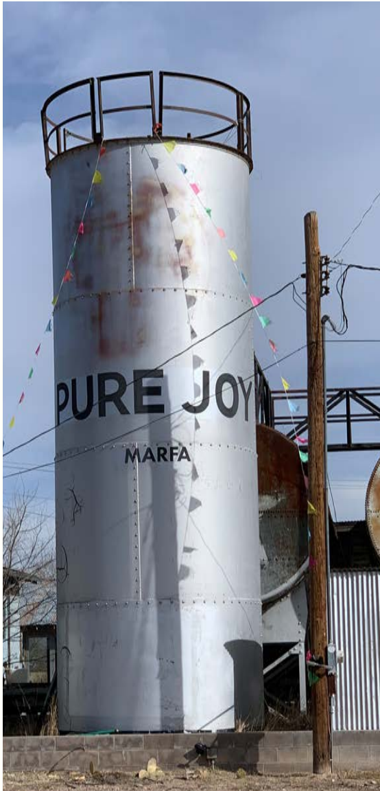
PURE JOY MARFA