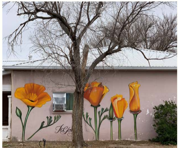
FLOWERS ON HOUSE WALL MURAL