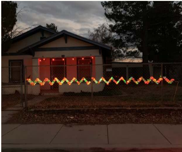
TOPO CHICO CHRISTMAS DECOR NIGHT VIEW