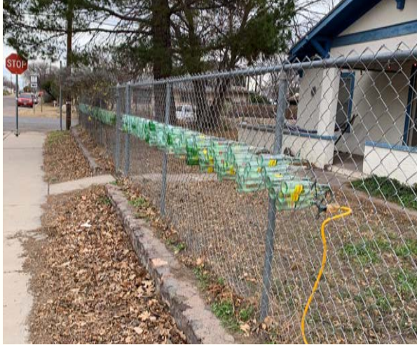
TOPO CHICO CHRISTMAS DECOR DAY VIEW