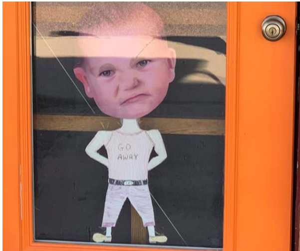
GO AWAY ON THE FRONT DOOR